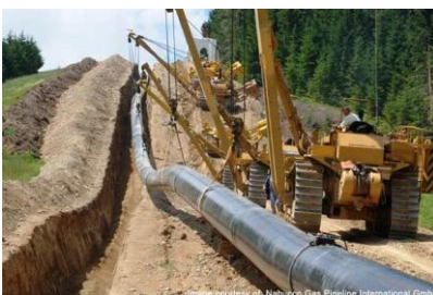
Photo: Hydrocarbons industry

Officials from Ministry of Mine and Industries have stated that an agreement for the extension of a gas pipeline from Central-Asia to South-Asia through Afghanistan is soon to be signed. The technical studies of a new pipeline project starting from Turkmenistan, and extending to Pakistan and India will be